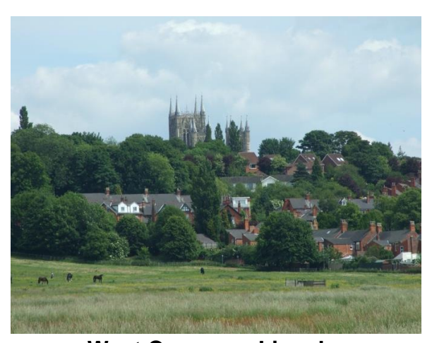
West Common, Lincoln.

This item came about due to a previous discussion. Some members felt that 'Chairman' came more naturally and seemed more respectful, others disagreed on the grounds that 'Chair' seemed more inclusive and up to date. It was suggested that whoever was elected to chair the meeting should be able to decide how they would prefer to be addressed. The present Chairman advised that he was happy to be addressed as either, depending what members felt comfortable with.