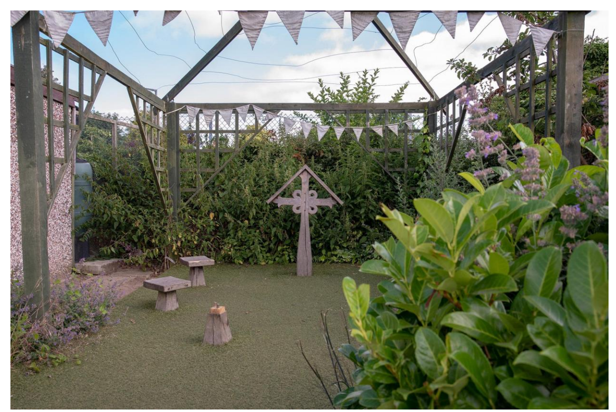
Ellison Boulters CE Primary academy (From School Public Web site)